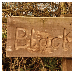
BLACKTHORNS The name sign for a fishing platform