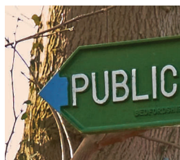
Public Bridleway Can be used by walkers, cyclists and horses