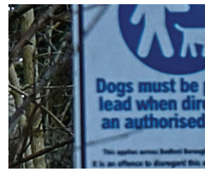
Dog Control Order instructing owners to keep dogs on a lead.