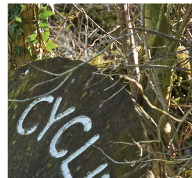
No Cycling on the Footpath