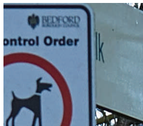
Dog Control Order Asking owners to clean up after their dogs