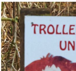
Troll Bridge in Norwegian, the language of the Trolls who live under the bridge!