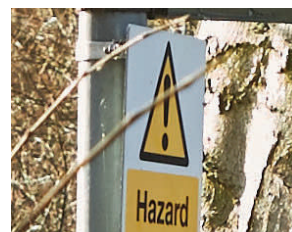
Hazard Deep Water